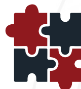
Integrated Management Systems (IMS)