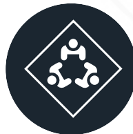
Compliance Framework Design