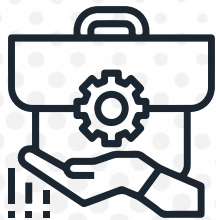
Management Systems Consultancy