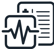
Occupational Hygiene & Health Services