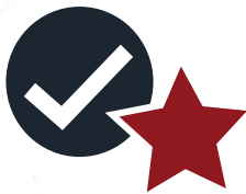
Quality Management Systems (ISO 9001)