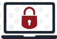
Information Security Management Systems (ISO 27001, RFFR)