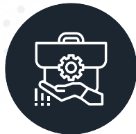
Management System Development & Implementation