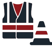
OHS Management Systems (ISO 45001, National Audit Tool)