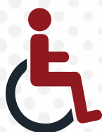
NDIS Quality Framework