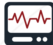
Medical Devices Quality Management Systems (ISO 13485)